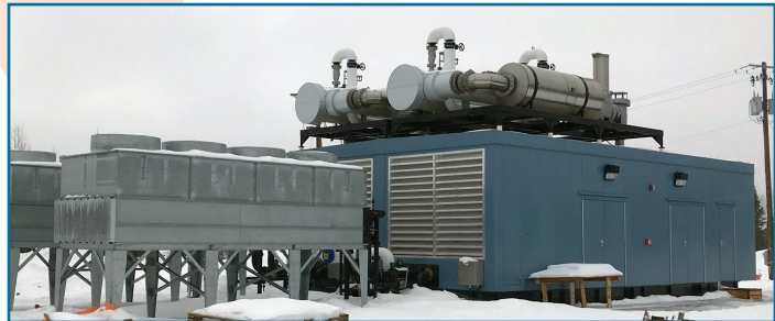
Kirkland Lake 2.2 MWe Combined Heat and Power Project built by CEM Projects and Stolk Construction in 2018.